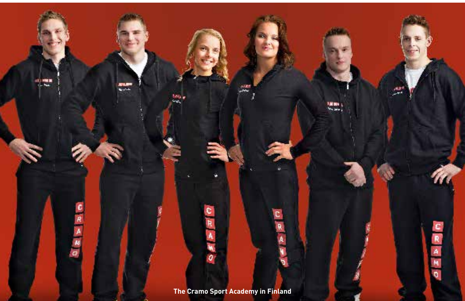
The Cramo Sport Academy in Finland

Cramo Norway sponsors the Female National Team in Ski Jumping, and Cramo Finland supports promising young athletes.